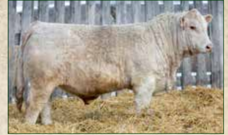
4128L- Full brother