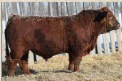
14J- Full Brother