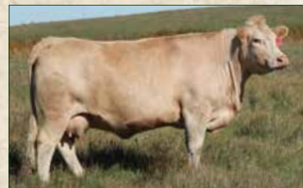
581C- Grand Dam

Dam (1921F) still producing at 6 Grand dam (581C) sold in dads dispersal sale to TF Cattle (BC) and is still producing at 9 Great grand dam (401P) produced until 18 Great grand dam x 2 (244M) produced until 15 Great grand dam x 3 (27H) produced until 14 Maternal brothers working at SS + M Farms Inc (KS USA) and Zemlicka Farms (SD USA)