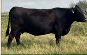
4662M - 4174L Dam