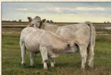
4584M and dam pictured August 2024