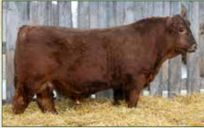
4110L - Maternal Brother