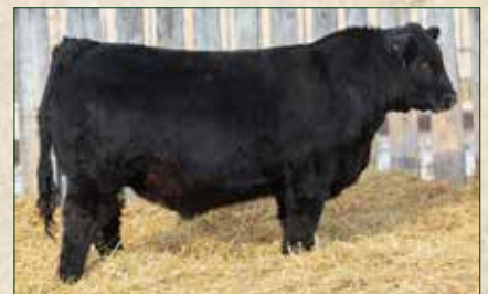
4662M - Maternal brother - Lot 30