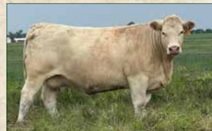
8142F- Grand Dam

Great grand dam x 3 (3K) produced until 12.