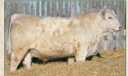
3118K- Full brother