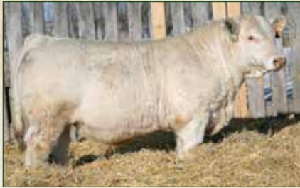
3146K - Maternal Brother