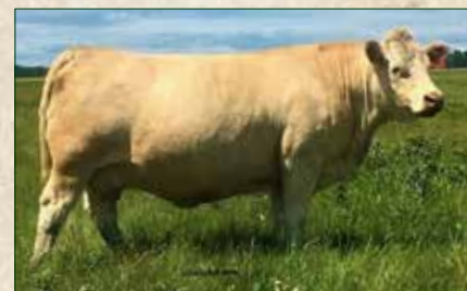
180Z- Great Grand Dam