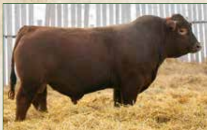
229K- Full brother