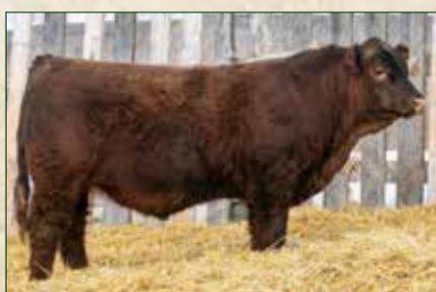
4121L- Maternal brother