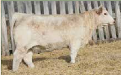
73J- Maternal sister