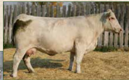
72B - Dam

Maternal (3/4) Brother to TRI-N Go North 2411H who sold for $80,000 to Palmer Charolais (SK) and Bob Charolais (AB). A Go North Son topped the 2024 Palmer Sale at $31,000. Daughters highlighted the historic Bob Charolais Dispersal this fall.