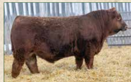
501L- Maternal Brother