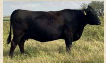
123H - Dam

Semen has been sold in Canada, USA and Australia. Selling full possession and 50 straws of semen for in herd use.