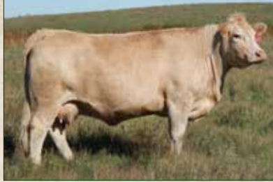
581C- Great grand dam

Heifers first calf. Grand Dam (920F) still producing at 6, great grand dam (581C) sold in dads dispersal to TF Cattle (BC) and is still producing at 9, great grand dam x 2 (401P) produced until 18, great grand dam x 3 (244M) produced until 15, great grand dam x 4 (27H) produced until 14.