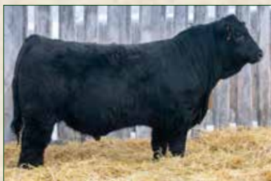
497L- Maternal brother

Maternal black factor brother sold in last years sale to Ralph and Marsha Duchsherer (ND USA)