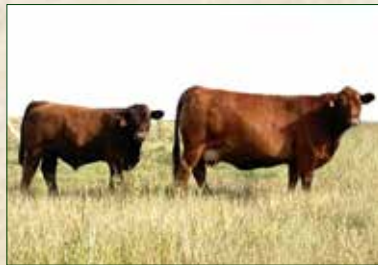
4565M and dam Aug 2024