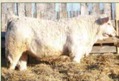
1017G - maternal brother to dam. Used in our PB herd

Heifers first calf Grand dam (329A) produced until 10 Great grand dam (23R) produced until 10