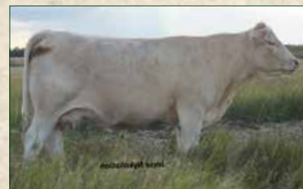
72T- Great grand dam at 12

Dam (1J) still producing at 3 years old Grand dam (913G) sold in Dad's female dispersal Great grand dam (371A) produced until 6 Great grand dam x 2 (72T) produced until 14 72T was one of my all time favorites here and would rank as a 9.9/10 for what works here (only because the perfect 10 doesn't exist).