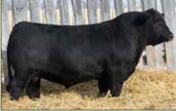
4174L - Maternal Brother

Maternal brother to TRI-N Black Factor 4174L, our high selling bull in 2024 to Bluestone Beef Composites and Morgiana Beef Composites, New South Wales Australia. He sells as lot 54 as its more economical to ship semen than a live bull to Australia.