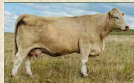
402B- Maternal sister to dam

Great grand dam x 4 (6T) produced until 9