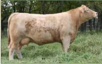
37S- Grand Dam