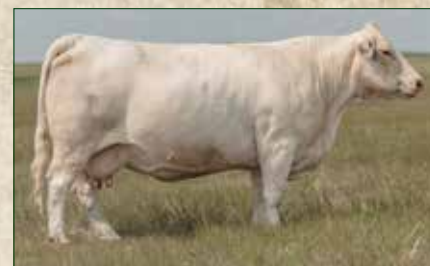
SOS 33Y- Dam

Maternal sibling to the Canadian National Champion Female (SOS Jessicah) and sired by the 2024 Agribition Supreme Champion Bull (SVY Mayfield)