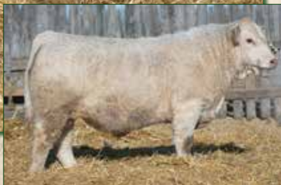
Go North 2411H- Maternal Brother