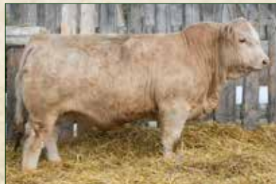
4160L- Maternal brother to dam

Maternal brother working at Chad Esau (BC)