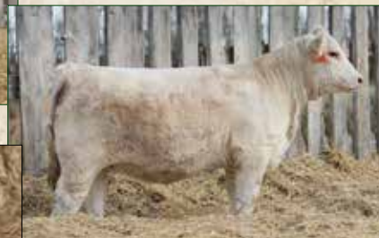
2105J - Maternal sister