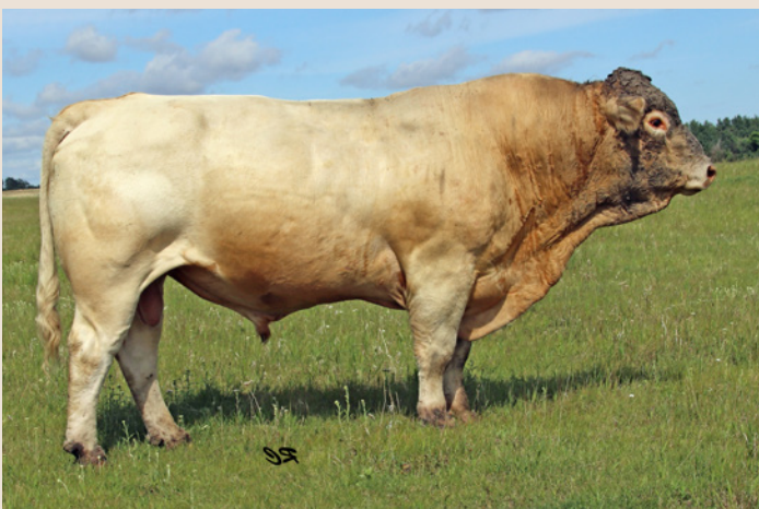
oakstone PICK AXE 58f