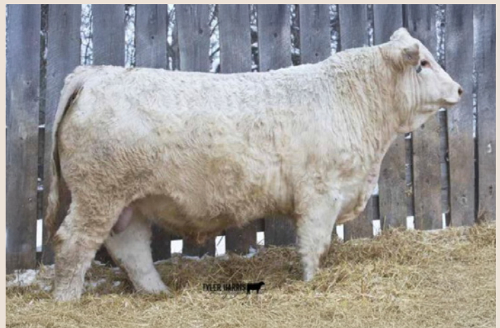
dogpatch FIESTA 296f