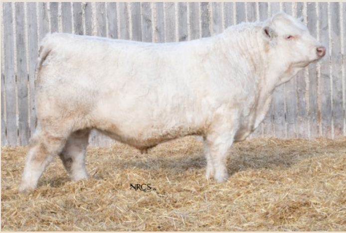
oakstone WARRANT 12k