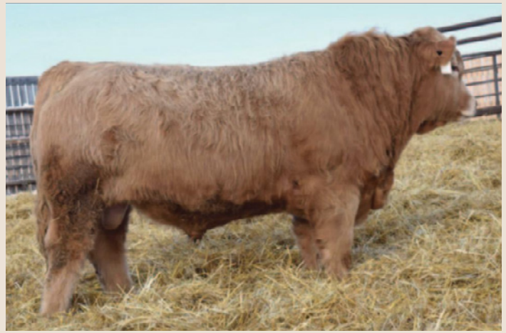
pro-char JOKER 48l