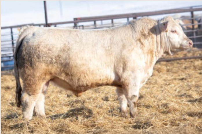
footprints WARLOCK 2130k