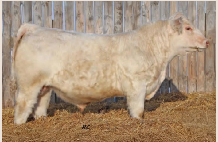
oakstone LIEUTENANT 12l