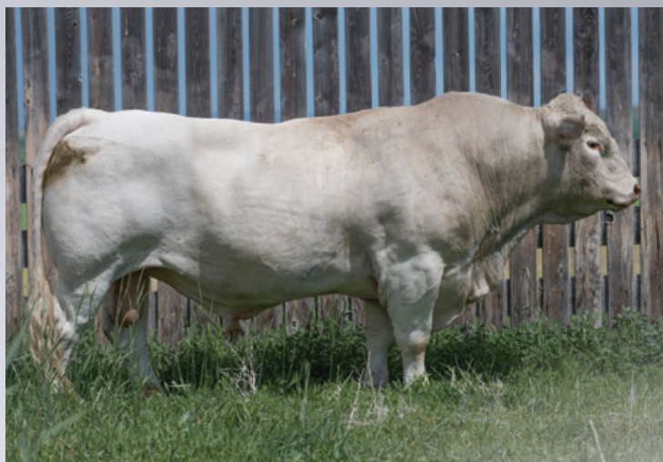
HC JAGERMEISTER 160J