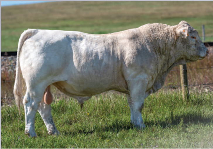
HOPEWELL MAHOMES 15L