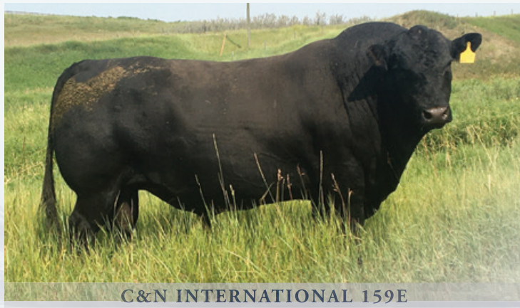
C&N INTERNATIONAL 159E