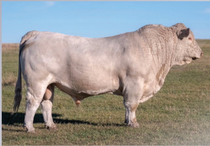
CEDARLEA YELLOWSTONE 184H