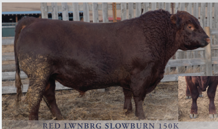
RED LWNBRG SLOWBURN 150K