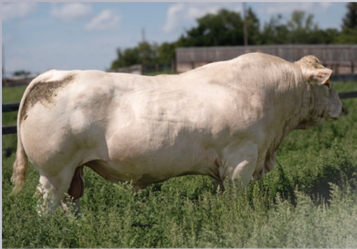
KEYS DUDE 223J