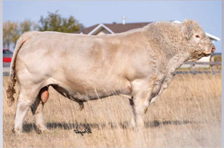
STEPPLER MAGNUM 99G