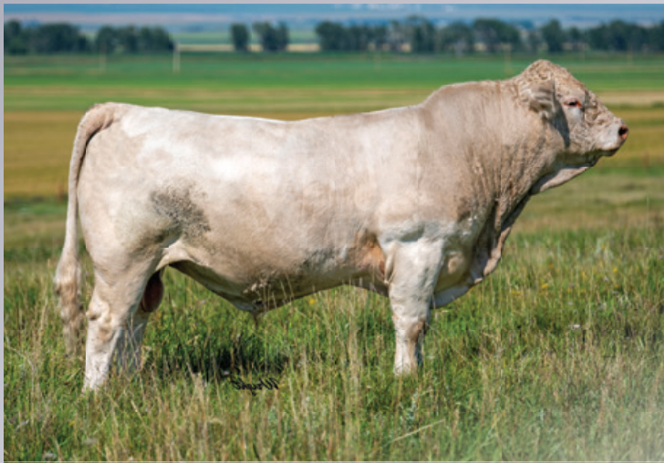
Sparrows Lampman 301L