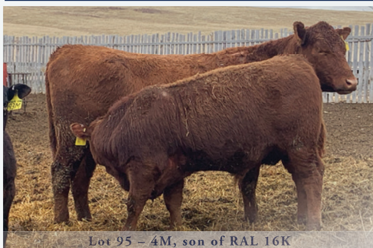
Lot 95 - 4M, son of RAL 16K