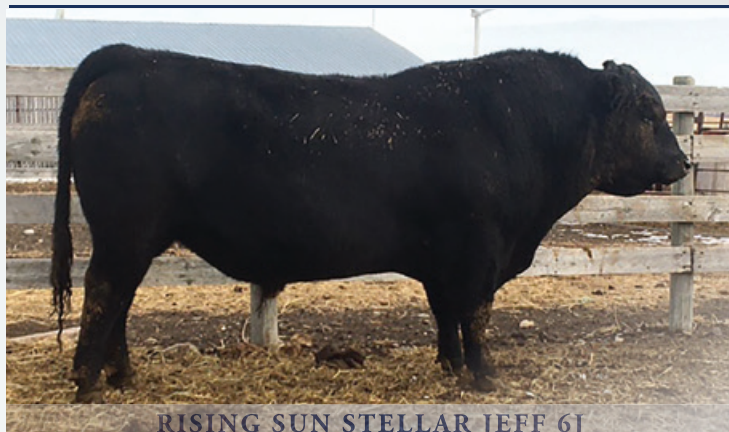
RISING SUN STELLAR JEFF 6J