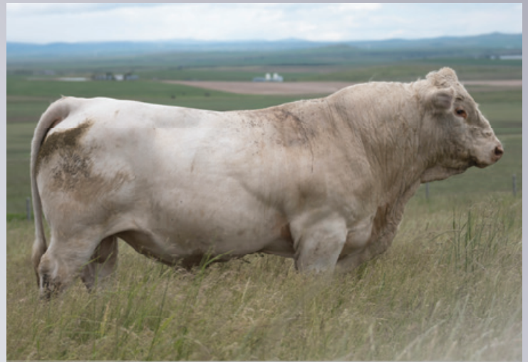
SPARROWS DEFAULT 255K