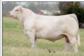
Sire of Lot 12 WC Milestone 5223 P

SPARROWS CHITEK 930W(P) DIAMOND W CHITEK 85B(P) DIAMOND W MAGNETIC 129X(P)