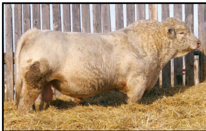
MR BLADE 5B