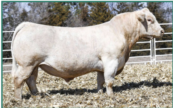
RESOURCE 417 P