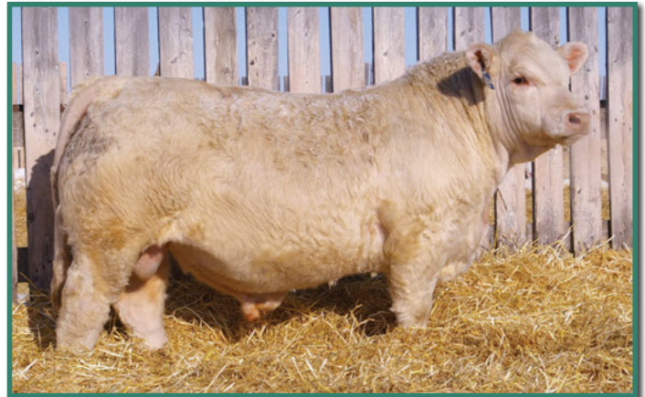
HOME FREE 110H