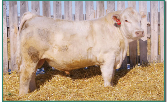
HEAVY DUTY 99H