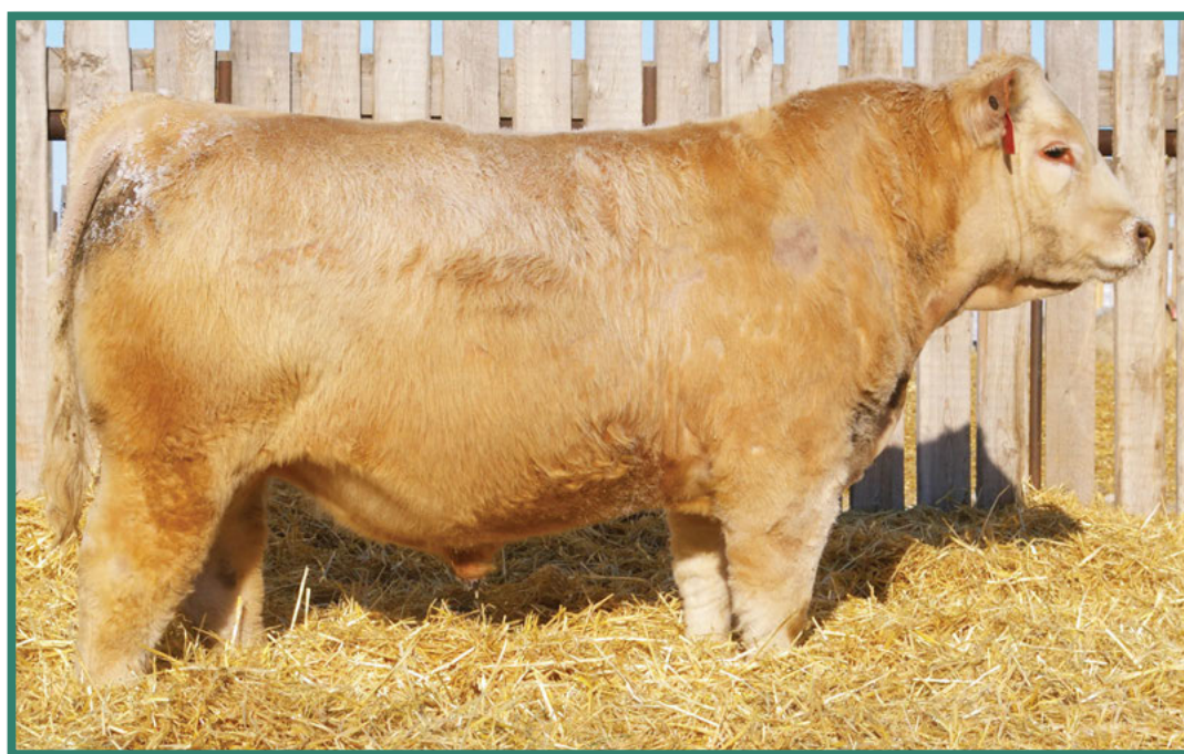
HUGH HEFNER 14H