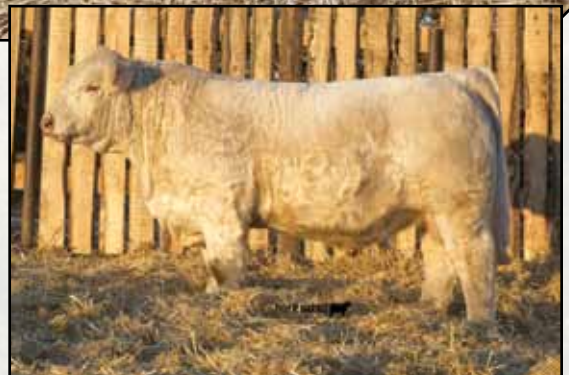
SOS Keystone 112E

Tremendously long bodied, great thickness and an amazing hair coat.