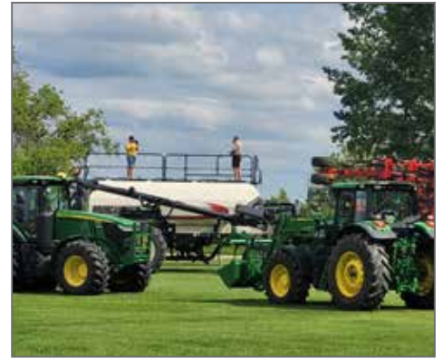
Cam had his equipment cleaned up and on display which had many checking them out