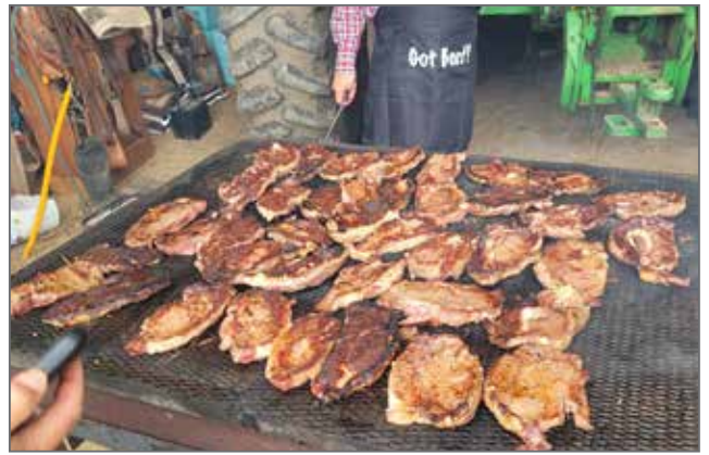
The BBQ rib steaks were a hit that day with many internationals checking out how they were cooking them