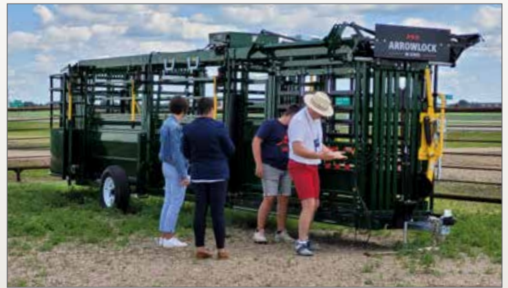
Next stop was Norheim Ranching with a full line of livestock handling and haying & feeding equipment on display