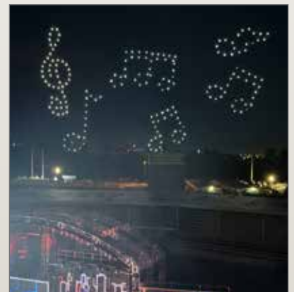
The Canadian Charolais Stampede breakfast was followed by a full day at the Calgary Stampede (another bucket list item for many) including the rodeo, chuckwagons, Indian relay race & evening show