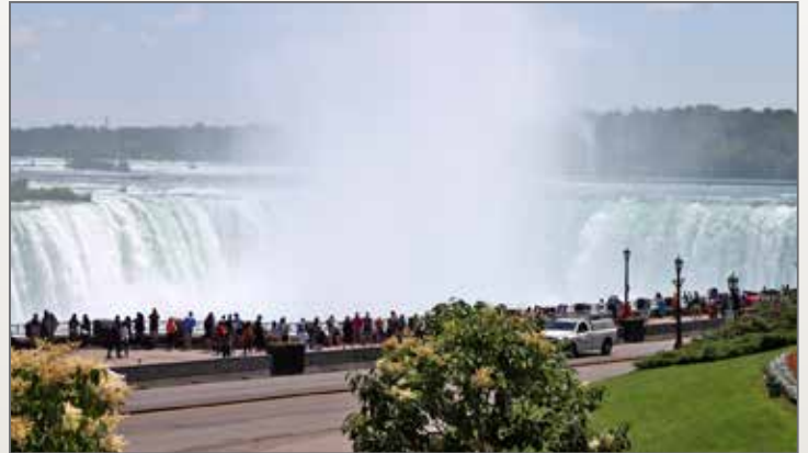
Niagara Falls was on many people's bucket list and the view at lunch on a beautiful day was icing on the cake