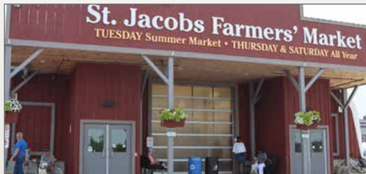
St. Jacobs Farmers Market was the first stop on the tour