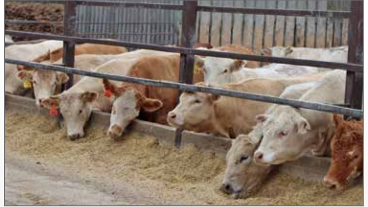
It also included an informative tour down the road at Swain Feedlot with a big question and answer session