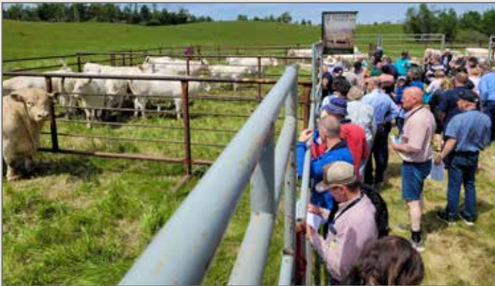
Hunter Charolais had an impressive display of herd bulls, cow/calf pairs and bred heifers in a pasture on a beautiful day