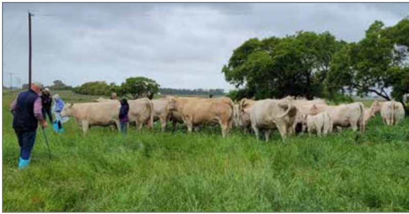
Showers at the event hosted by White Cap & Rosso Charolais didn't deter the viewing of cattle