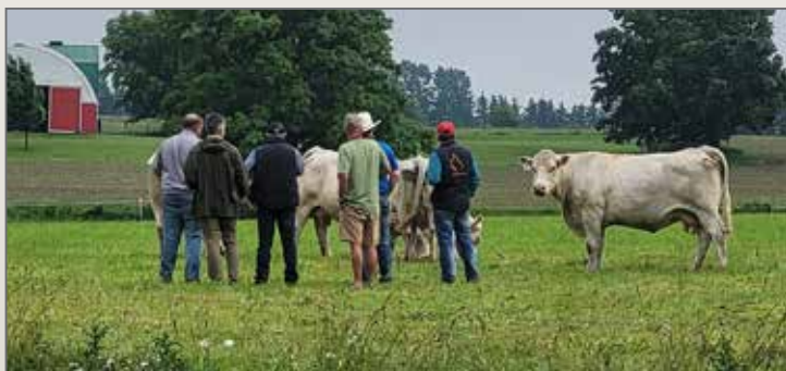
At Rollin' Acres Charolais an hour and a half north of Toronto, they and the Uppin' the Ante sale group displayed cattle and had a tent to enjoy when it rained, listen to a band and have supper.