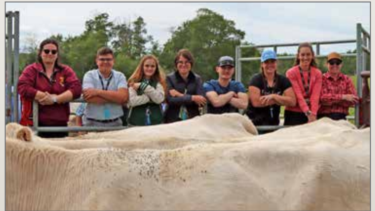
Young adults from France, Hungary, New Zealand, England & Australia were on the tour