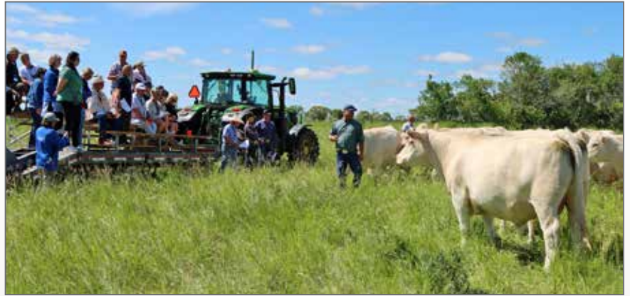
The pasture tour at HTA Charolais and pen displays from other breeders exemplified how quiet all the Canadian cattle were