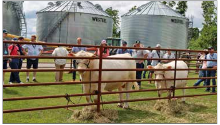
Day 3 at Cedardale Farms saw some pasture tours and other breeders bringing cattle to display.