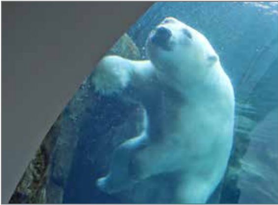
Seeing polar bears swim above you at the Zoo in Winnipeg was great for many to see