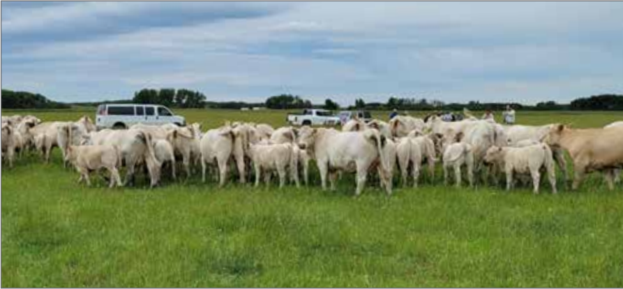
After another free morning in Moose Jaw it was off to CK Sparrow farms for a pasture tour and pitch fork fondue steak supper