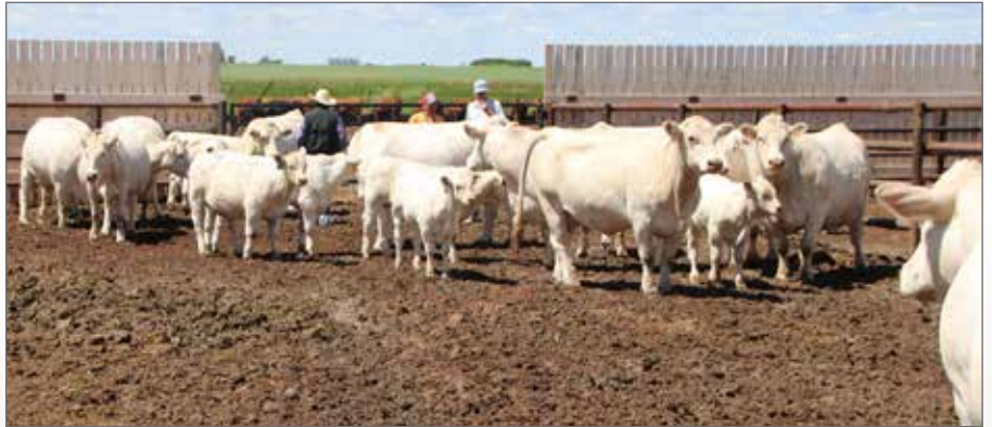
A tour and lunch at the impressive new BoviGen embryo & semen collection facility at Moose Jaw had guys checking out the donor females