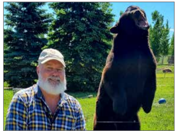
At the Discovery Wildlife Park at Innisfail, many had their picture taken with a bear as well as seeing many animals indigenous to Canada