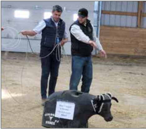
Roping lessons and hockey puck shooting were enjoyed by lots of the international guests at Cedarlea