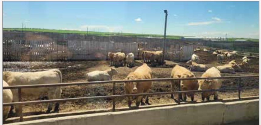
Highway 21 Group provided us with two informative stops. One at their Hanna ranch where they are doing feed efficiency and residual feed intake research and the other at their 20,000 head feedlot at Acme.