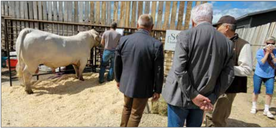
Cattle displayed by five breeders and the mechanical bull made the stop at Steppler Farms in Manitoba very enjoyable