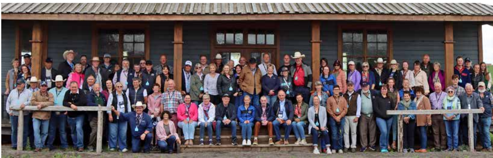
A group shot at John Scott Productions near Longview, AB

World Charolais Congress 2024 saw Canada welcome the world for 15 days from Ontario to Alberta. Charolais producers from 12 countries, not counting Canada, met in Toronto on June 21st and departed Calgary on July 6th. Three days were spent in Ontario, three in Manitoba, three in Saskatchewan and five in Alberta. The Congress is held every two years around the world, the last one in Canada was in 2006. This was also the first of the five times in Canada that it was held outside of Alberta. The Congresses are a mix of cattle and tourism and we tried to show a cross section of our country and cattle.